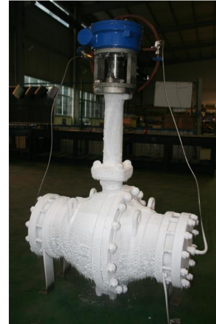
CRYOGENIC BALL VALVE - 196 DEGREE C. 10" 150LBS BUTT WELD END TRUNNION TYPE