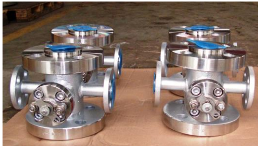
HIGH PRESSURE JACKET BALL VALVE 3/4" 600LBS FLANGED END FLOATING METAL SEAT