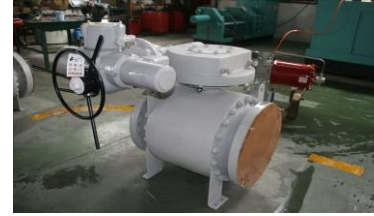
ELECTRIC BALL VALVE