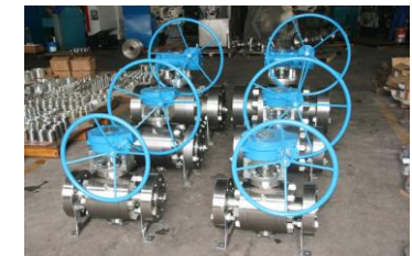
3" x 2500LBS 316SS BODY/PEEK SEAT