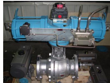
HIGH SPEED (1S) BALL VALVE 6" 300LBS FLANGED END FLOATING TYPE METAL SEAT