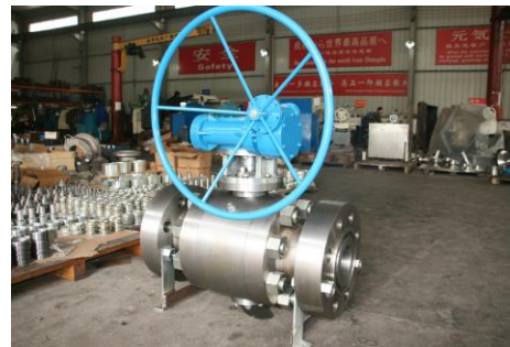
6" x 2500LBS A105N BODY / PEEK SEAT