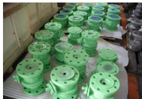
FOR COLOMBIA ( STOCK )