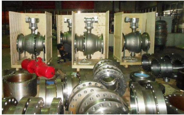
20" x ANSI 150LBS 316SS TRUNNION & SMALL CARBON STEEL BALL VALVE FOR POLYACETAL PLANT IN THAILAND