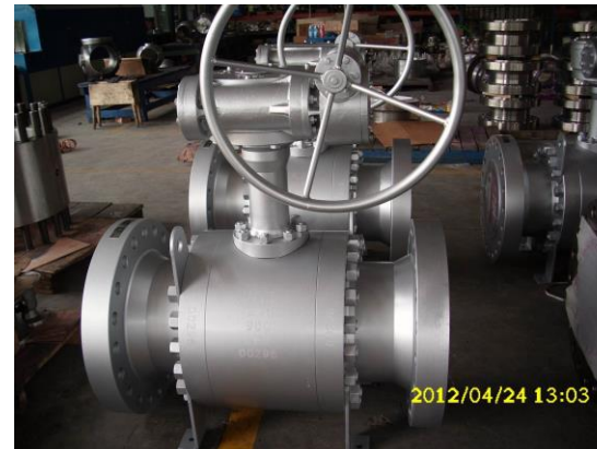
12" x ANSI 900LBS LF2 BODY FOR LNG MALAYSIA